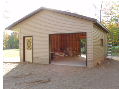
Our new garage